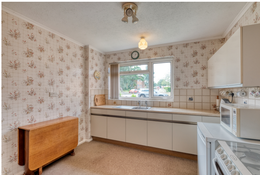
Downsell Road, Redditch Ground Floor